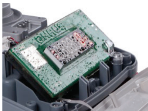
Inside PCBA Silicon Glue Sealing

The flow-thru, water-resistant design allows for safe weighing of liquid components and can be used in harsh or damp environments. Valor 2000's IPX8 full waterproof construction and silicon glue sealing design to its PCBA make it durable in extreme environments and eliminates the risk of water damage. Additionally, cleaning your scale has never been safer and easier, further ensuring the cleanliness of your workstation.